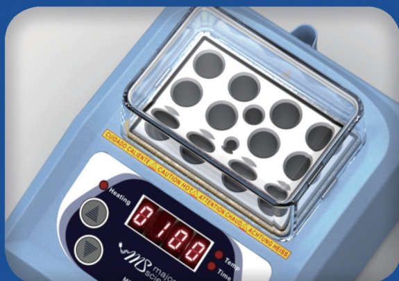
Clear cover to ensure temperature uniformity

The first of mini thermoblock product line, mini dry bath is finally here. It is compact in design yet powerful enough to fit all your incubating needs. Whether you need to incubate your PCR strips or use it as a water bath, the MD-MINI is up to the task. The molded PTFE coated chamber also allows you to use it as a water bath. The interchangeable ability of the heating block brings you the convenience of a traditional dry bath.