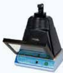
MUV21-CP-03 / MUV26-CP-03