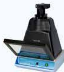
MUV21-CP-02 / MUV26-CP-02