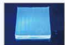
Optional Blue Light device