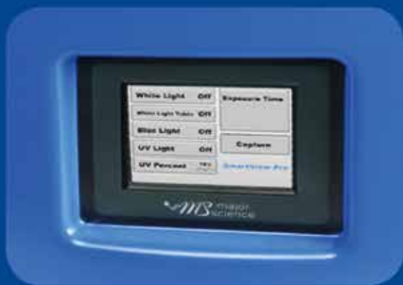
UVCI-1200 LCD touch screen