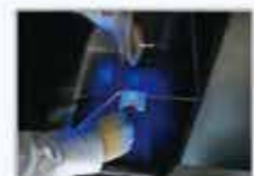
Easily gel cutting design with UV