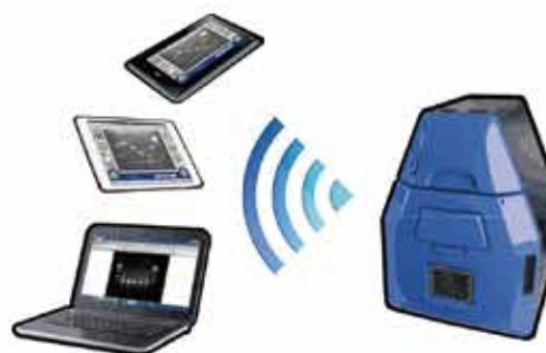
Wi-Fi connection for wire-free lab environment