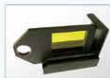
Up to 4 filters