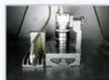
easily placed by magnetic near camera