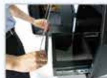
Easy installed by magnetic design